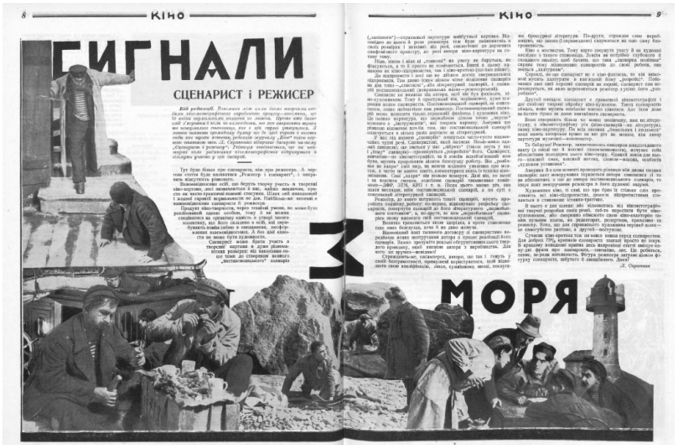
Illustration 13. Photo collage of the film «Signals from the Sea».

The collage does not correlate with the content of L. Skrypnik's article «Screenwriter and Director» (Skrypnik, 1927), in which the author highlighted the difficulties of creating a high-quality screenplay. The author along with the mentioned collage submits the article. All the photos are so tightly placed next to each other that, due to the smooth transition of one scene to another, there is the effect of watching episodes of the film, in which pre-confrontational