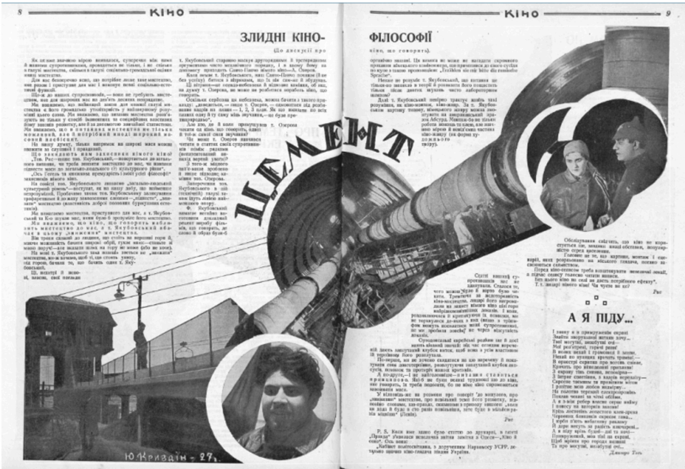
Illustration 15. Photo collage of the film «Cement».

Rys analyzes the statements of supporters of silent cinema, criticizes them and defends the position of cinema with sound. Next to the article, the author placed a photo collage advertisement (see illustration 15) of Yu. Kryvdin's film «Cement» (Kryvdin, 1927), which does not correspond to the given text. In it, the author presented an image of the plant, the scale of which he emphasized with the help of two large pipes, which are directed deep into a circle, the end