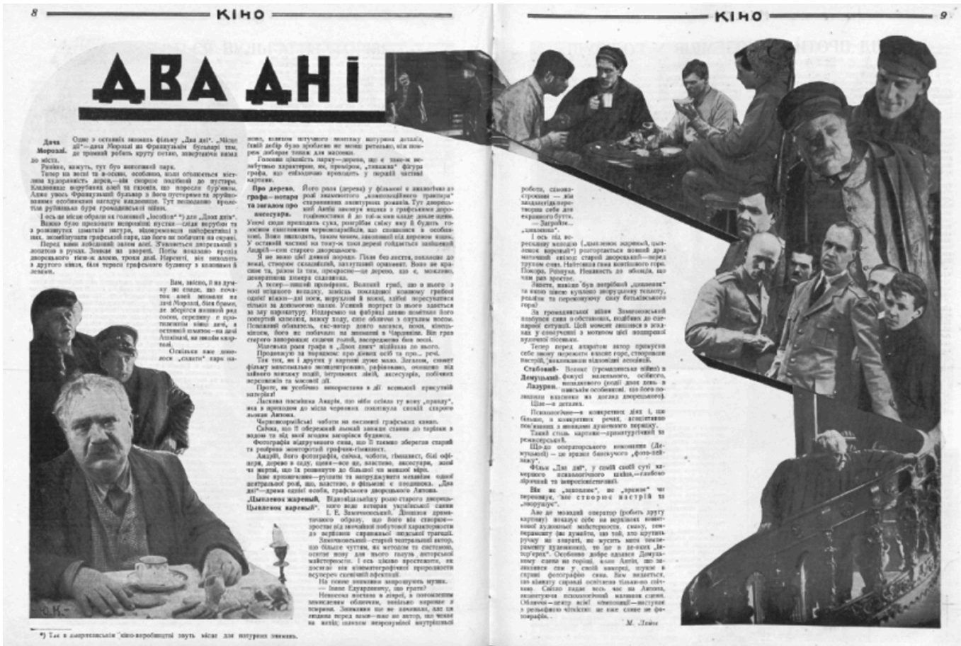
Illustration 10. Photo collage of the film «Two Days».

In the magazine «Kino» No. 9 for 1927, the publisher published M. Lyadov's film review «Two Days» (Lyadov, 1927). The film review has a non-standard composition – 4 parts («Dacha Morozli», «About a tree, a notary count and generally about accessories», «Roasted chicken, Boiled chicken», «Stabovy-Demutsky-Lazuryyn»), the names of which are placed at the beginning of the paragraphs. Alongside the text of the film review, the author published a photo collage divided into two parts (see illustration 10) of the film «Two Days» (Yu.K., 1927) by Ю. К. On the part of the photo collage placed on the right, the silhouette photos, due to their dense arrangement, create an overall picture, the vertical placement of which contributes to the effect of watching part of the film. In the first photo from the bottom, the author used a spiral staircase, which, thanks to the technical