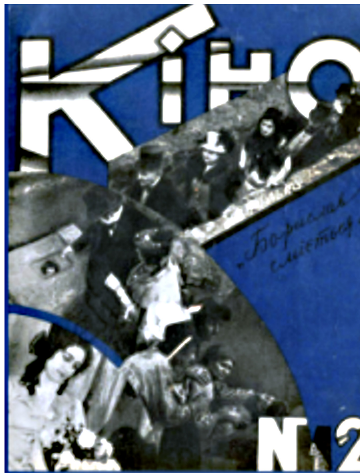
Illustration 14. Photo collage of the film «Borislav Laughs» Cinema 1927 No. 12 (cover).

In the magazine «Kino» No. 12 for 1927, for advertising and informational purposes, the author used a photo collage (see illustration 14) of the film «Borislav Laughs» (Borislav Laughs (film photo collage), 1927). The author placed the photo collage on a blue background and used images of rich and poor people contrasting in terms of social status. It is symbolic, in our opinion, to place photos in such a way that the rich do not notice sad and poor people. In our