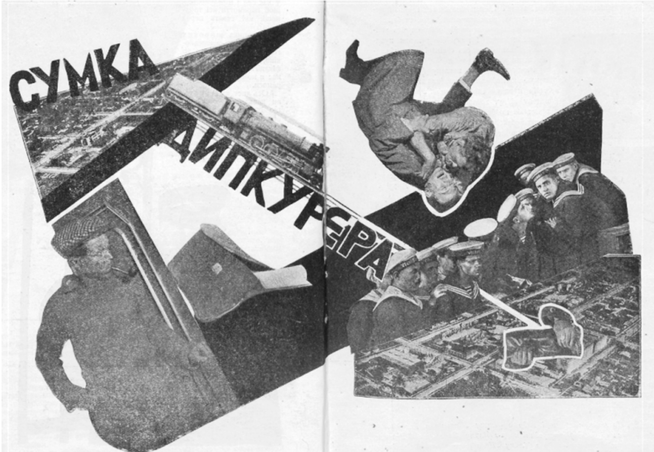
Illustration 8. Photo collage of the film «The Diplomat's Bag».

In the magazine «Kino» No. 5 for 1927, the publisher published an essay by Yur. Yurchenko (pseudonym of Yu. Yanovsky) «History of a Master» (Yurchenko, 1927). The essay has two main parts. The author called the first part («The Introduction», «The Diplomatic Courier's Briefcase»). The second part has four components: «1. Icebreakers «Makarov» and «Harry Liedtke», «2. Death to the music and admiration of Tefvik-Rushdi-Bey», «3. The sanctity of film or editing nights», «4. So»). In the text of the essay, the author placed a photo collage (see illustration 8) of the film «The Diplomat's Bag» (The Diplomat's Bag (film photo collage), 1927). This, in our opinion, is logical, since