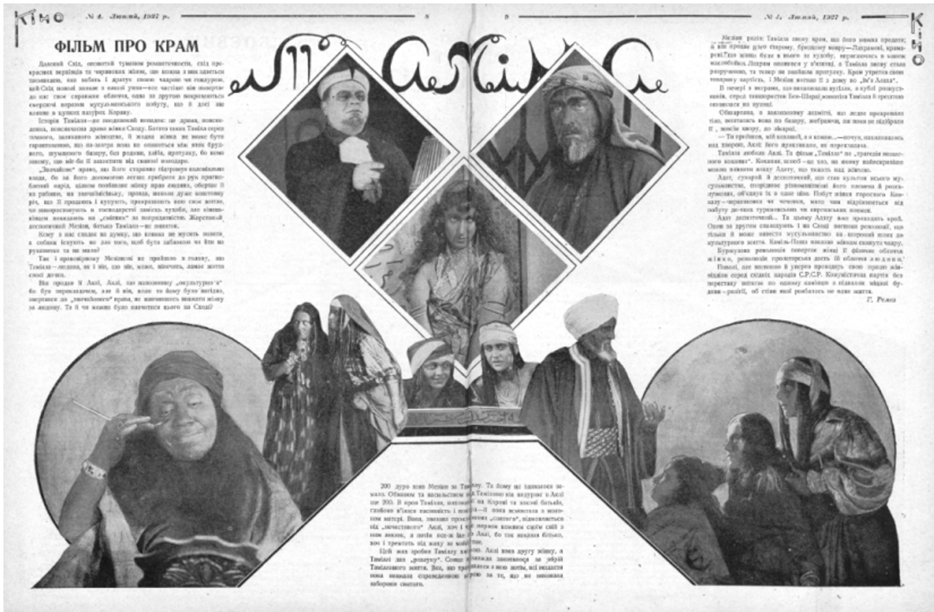
Illustration 7. Photo collage of the film «Tamila».

the film, the three letters (H A A) in the middle have a downward-pointing triangle, which is associated with the blade of a knife. Wave-like white and black splashes, repeating the shape of the letters of the word «arrest», in our opinion, are related to the general atmosphere of the dramatic tension of the photo collage.