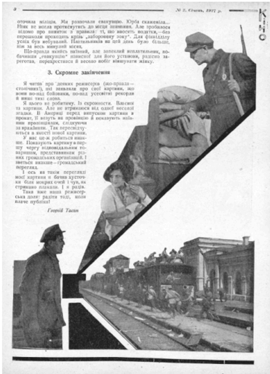
Illustration 4. Photo collage of the film «Arrest Warrant».

photos of soldiers and a frightened mother holding her child close to her. In addition, in the cone-shaped photo with the image of the train with the military, we see geometric figures of black color, the placement of which creates the illusion of a tunnel. The aforementioned shadow-casting train moves into this tunnel. In synthetic terms, such a shadow emphasizes the tension and drama of the image.