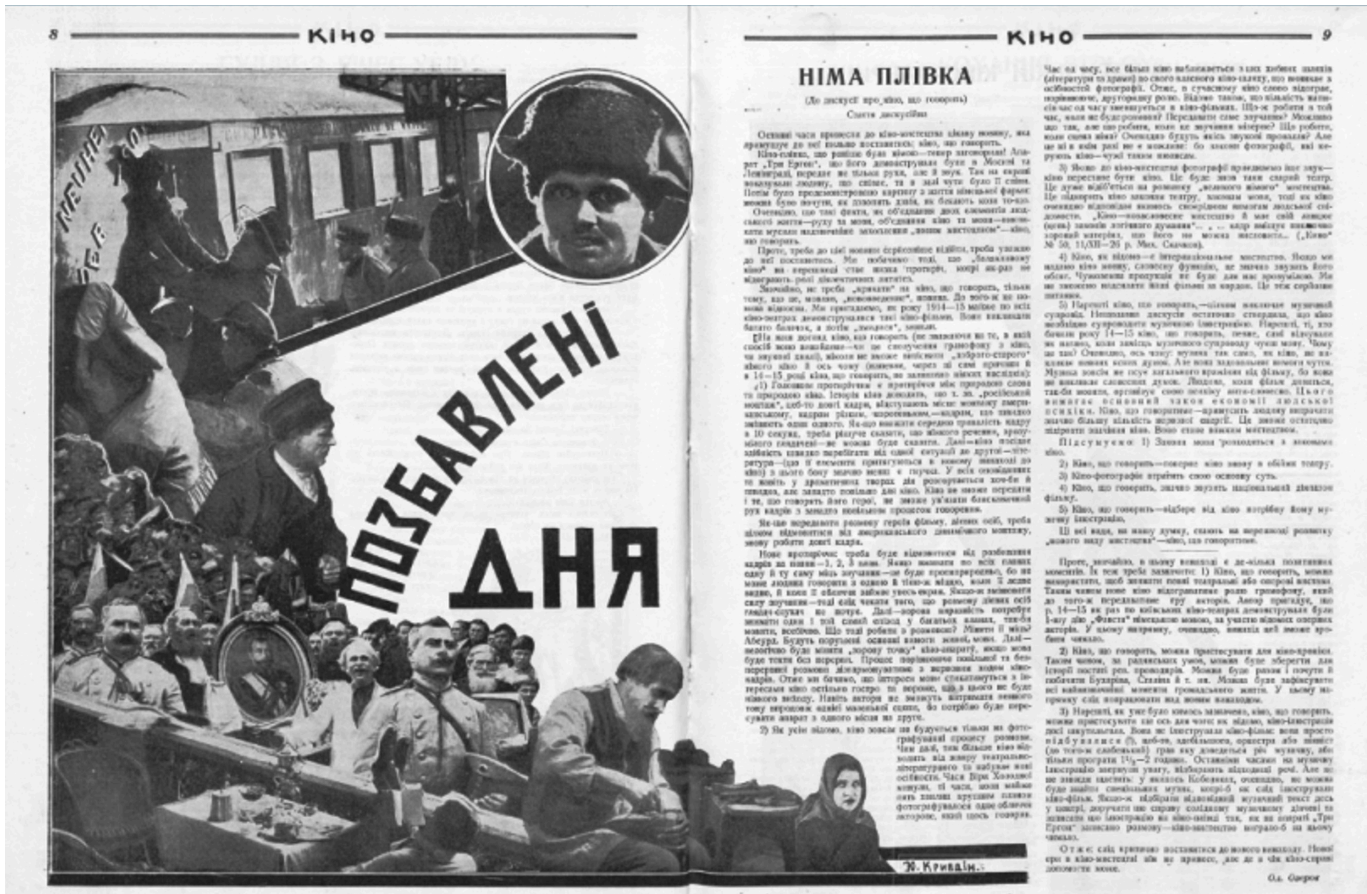
Illustration 9. Photo collage of the film «Deprived of the day».

is upside down. This element attracts the reader's attention because it forces him to take a closer look at the collage. The author according to the principle of contrast designs the name: black letters on a white background, as well as some letters with a white frame on a black background. In the magazine «Kino» No. 7 for 1927, the contributor used a photo collage (see illustration 9) of the film «Deprived of the Day» (Kryvdin, 1927), the author of which is Yu. Kryvdin. In addition to silhouette photographs, the combination of which creates an indivisible integrity of the picture and generates new meanings open to interpretations, in the photo