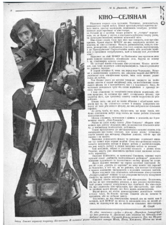
Illustration 5(1, 2). Photo collage of the film «The Diplomatic Courier's Briefcase».

the image of an elegantly dressed man trying to remain unnoticed) and confrontation (an aggressive man tries to attack a sailor). The imaging system of the second part of the photo collage, consisting of five silhouette photos, is diverse. Here the author presented the image of an unhappy woman, the image of a person lying on the floor and being looked at by other people with different emotional patterns (fear, joy). There is also an image of a sailor, a worker near a large mechanism that resembles a furnace, and an image of a mysterious, elegantly dressed person who seems to be hiding behind this machine. In our opinion, the author of the photo collage placed the silhouette photos in such a way as to create a general