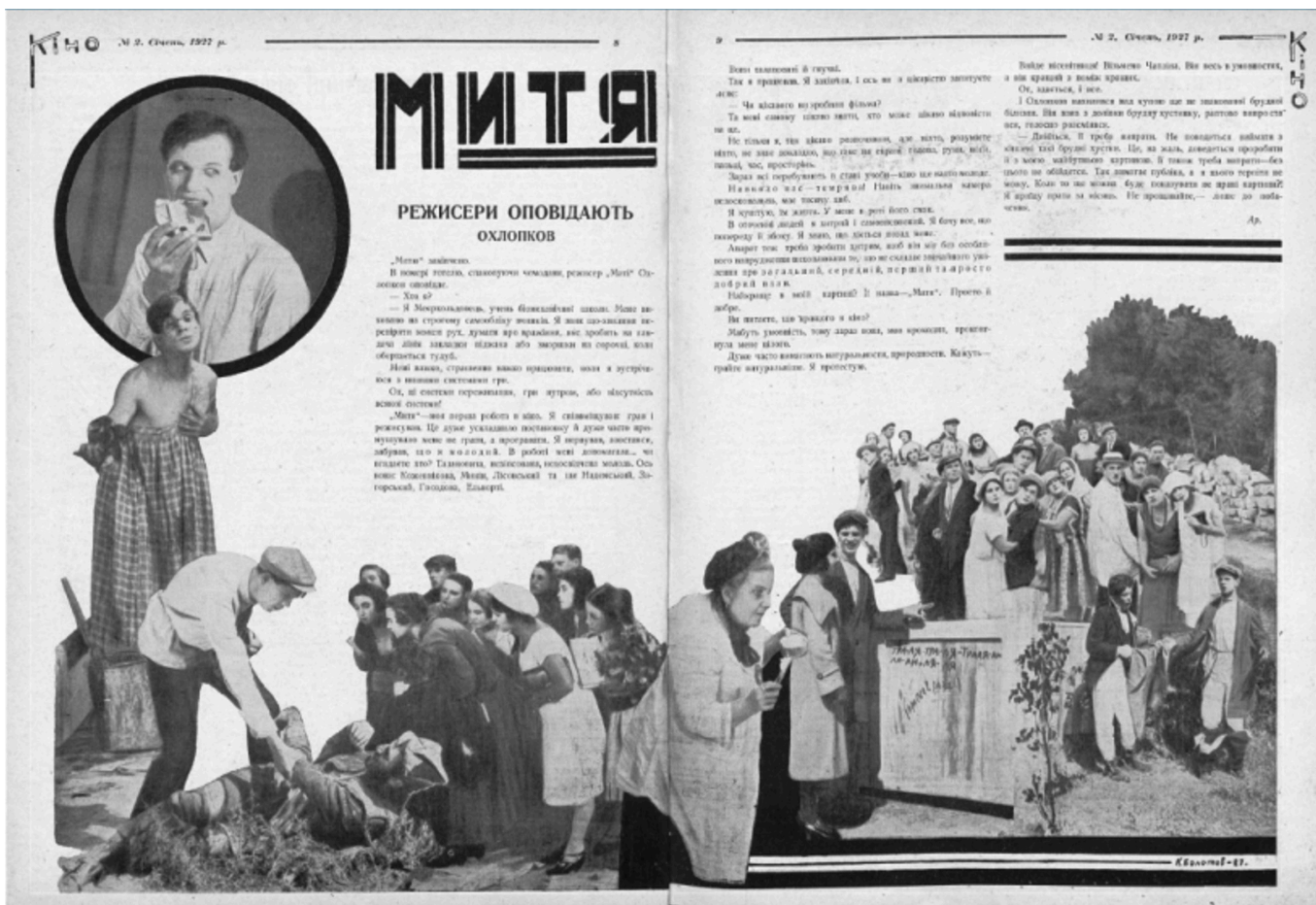
Illustration 3. Photo collage of the film «Mitya».

better in the cinema?» (Ar, 1927, p. 9)). In the photo collage (see illustration 3) of the film «Mitya» (Mitya (film photo collage), 1927), about the specifics of the shooting of which Okhlopkov told, the author used silhouette photographs in such a way that they form a general picture that produces new meanings. At the top left, the author has submitted a column-shaped photo with a black frame, which has an image of the main character eating a sandwich. The photo collage contains only the title of the film, which is designed according to the principle of double contrast: black letters are placed on a white background, and white lines are interspersed on the black letters. The author separated the photo collage from the text «Directors narrate. Okhlopkov» at the top with triple stripes of this colour combination (black – white – black) and five lines of different thicknesses at the bottom of this colour (black – white – black – white – black). It is noteworthy that underlining the letters ИТЯ in the title of the film with the aforementioned triple line not only draws the attention of the recipient to the title but