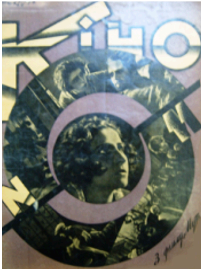
Illustration 12. Photo collage of the movie «Mud» Kino. 1927. No. 11 (cover).

In the magazine «Kino» No. 11 for 1927, the author placed on the cover a photo collage advertisement (see illustration 12) of the film «Mud» (Mud (film photo collage), 1927). To create a photo collage, the author used five photos, four of which he placed in semicircles placed in different directions. In the middle – a column-shaped photo of the hero, this has a purple petal frame. Three images represent the relationship between a man and a woman, in one the author