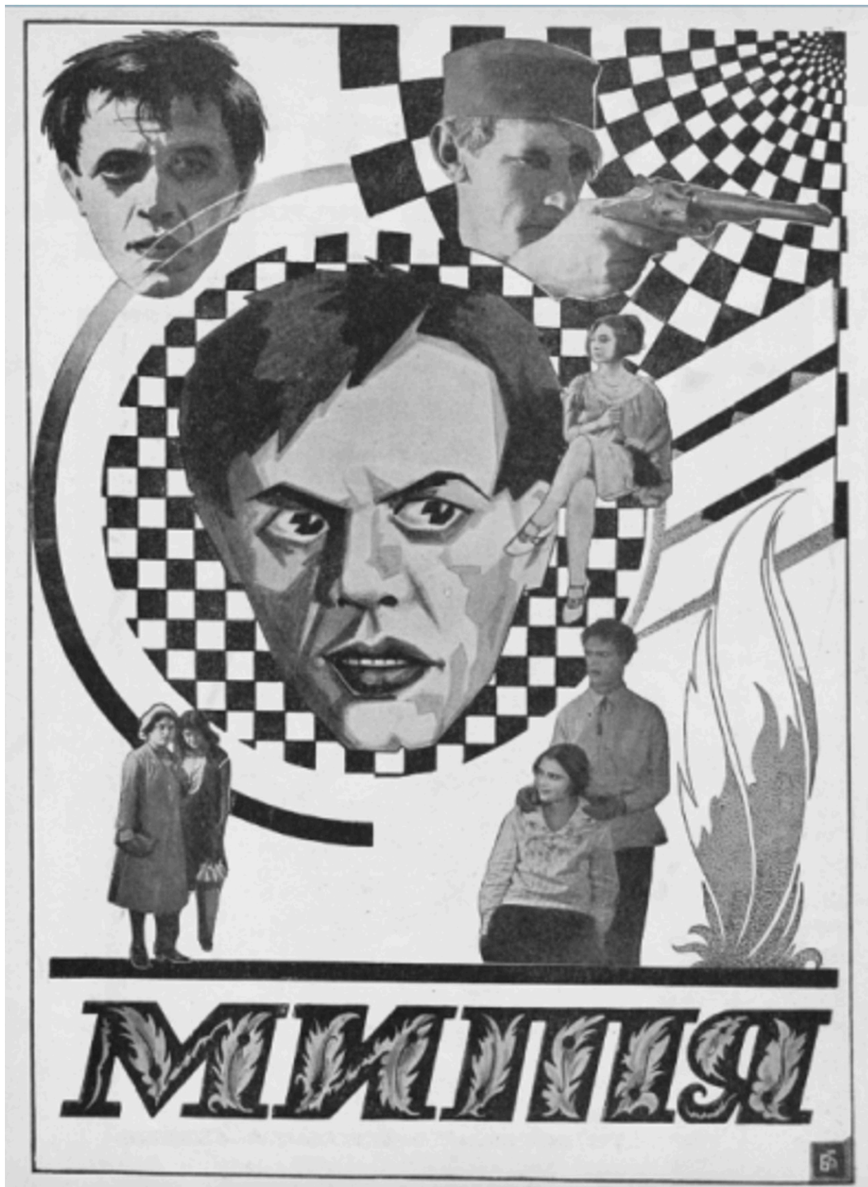
Illustration 2. Photo collage of the film «Mitya».