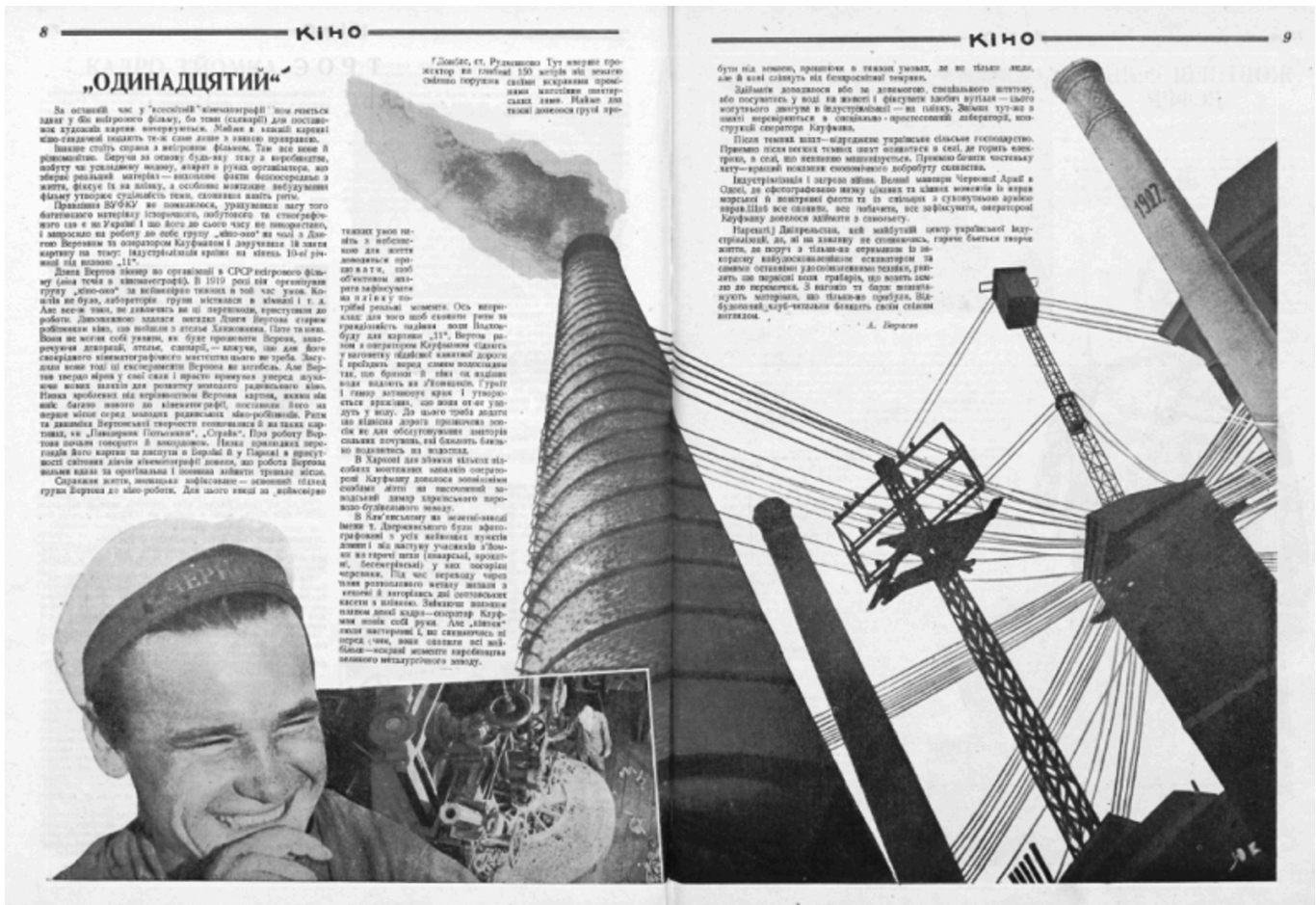
Illustration 21. Photo collage to the text «The Eleventh».

(black letters on a white background). In our opinion, an image resembling a sickle performs an intriguing function.