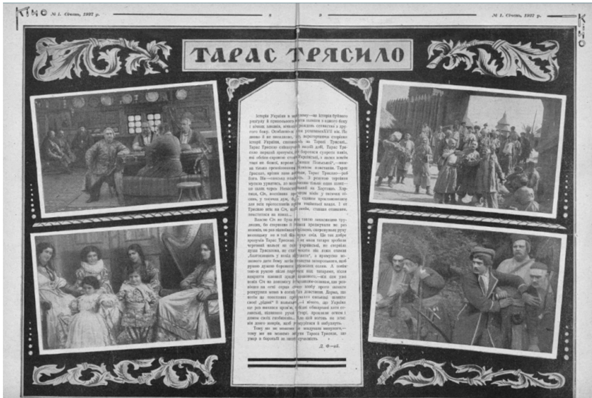
Illustration 1. Photo collage of the movie «Taras Trysilko».

2) of the film «Mitya» (Mitya (film photo collage), 1927), which contains six silhouette photos that capture different, sometimes contrasting emotions. It is noteworthy that the author has placed three characters on a checkered background in the shape of a circle and part of a cone-shaped figure. It is located in such a way that there is an effect of drawing in the silhouette photo of the head of the character holding a gun. The above-mentioned combinations of geometric figures with a checkerboard background with photos of characters expand the interpretive circle of what is depicted due to the created symbolic subtext. In addition, the author has placed some photos in such a way that simulations of new episodes are taking place. At the bottom right, the author has placed a drawing of a flame or a plant, which, given the form of presentation of the image, is open to interpretation. Under the black horizontal line demarcating the photograph and the illustration, the author placed the title of the film «Mitya», on the black background of the letters of which there is a pattern of leaves. Three silhouette photos and a note are placed on a white background.