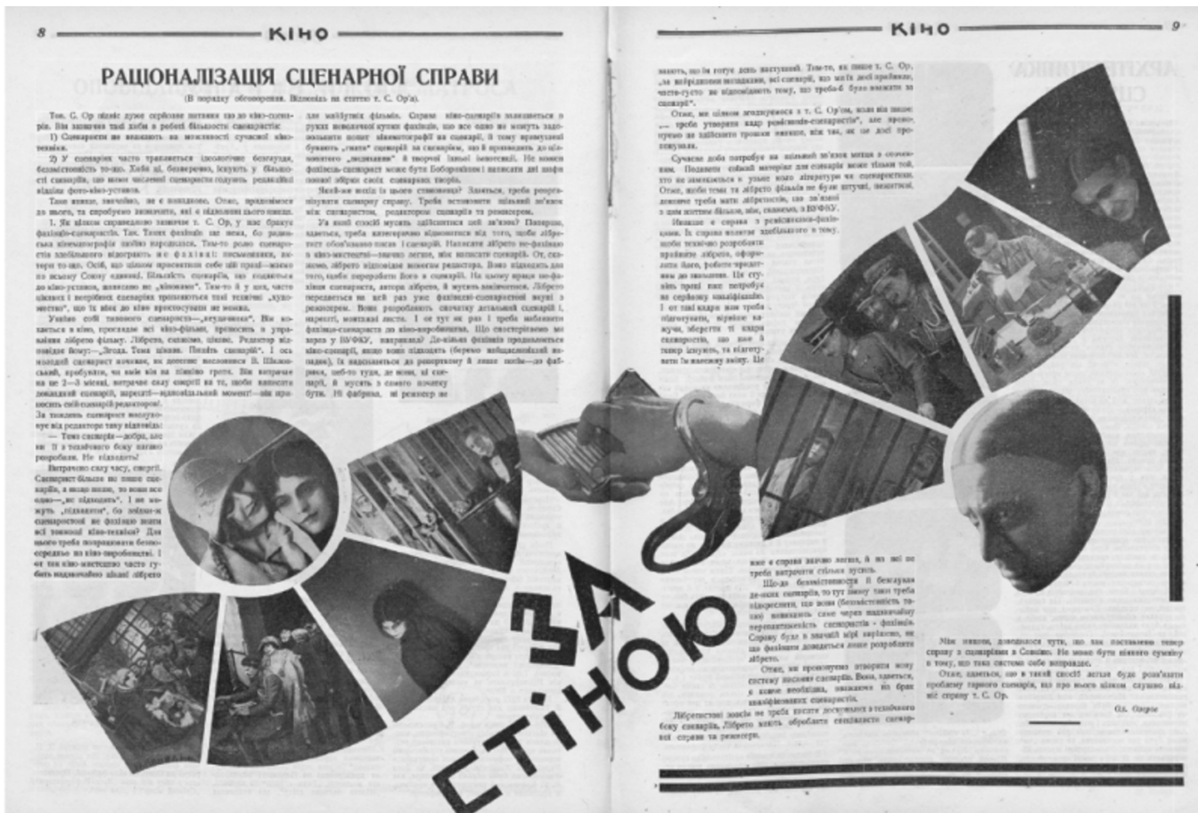
Illustration 11. Photo collage of the movie «Behind the Wall».

In the magazine «Kino» No. 10 for 1927, the editors published a discussion article by OI. Ozerov «Rationalization of the scenario case (In order of discussion. Answer to the article by T. S. Or)» (Ozerov, 1927). The content of the mentioned article does not correlate with the content of the photo collage (see illustration 11) «Behind the wall» (Behind the Wall (film photo collage), 1927), which performs informational and advertising functions.