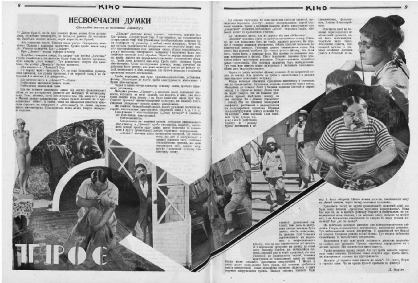
Illustration 16. Photo collage of the movie «Three».

In the magazine «Kino» No. 13 for 1927, on the front page, the author published a discussion article by D. Mariyan «Untimely Thoughts (Discussion notes for the production of «Cement»)» (Mariyan, 1927). In the article, the author highlighted tips for improving the film «Cement» and raised the issue of the lack of public discussions before the shooting of the film. In the text of the article, the author placed a photo collage advertisement (see illustration 16) of the film «Three» (Three (film photo collage), 1927), which does not correlate with the content of the article. The author filled the photo collage with photos of different shapes, silhouette photos, circle-shaped photos with funny situations, images of child kidnappers, Zorzhih with the governess, Zorzhih's father, and Senka. Some