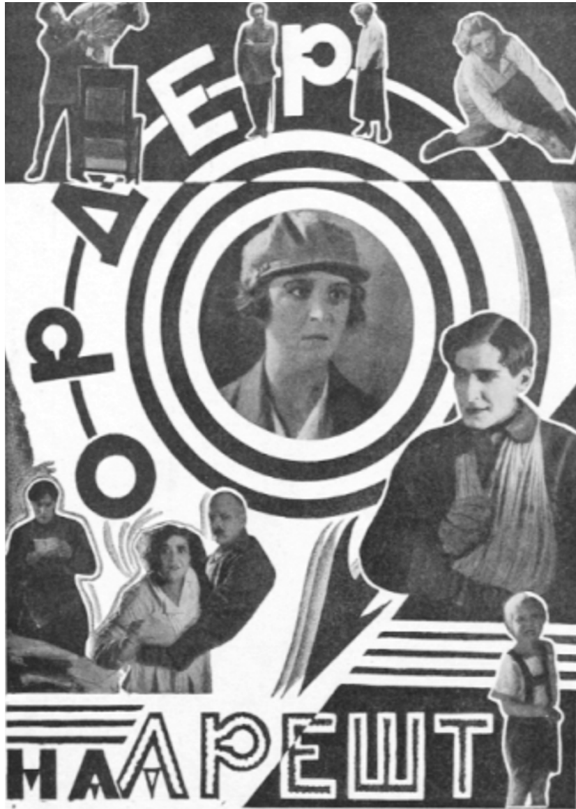
Illustration 6. Photo collage of the film «Arrest Warrant».

In the magazine «Kino» No. 4 for 1927 there is a photo collage (see illustration 6) of the film «Arrest Warrant» (Arrest Warrant, 1927). In our opinion, the specificity of the design of this photo collage is not only the colour contrast (white image on a black background, black image on a white background) design but also the transition of black to white and vice versa (letters, circles), which creates a philosophical subtext. The increase in symbolism is helped by the image of white and black circles around a circular photograph with the image of the heroine of the film, which can be interpreted as a spiral of life and a whirlwind of events in which the depicted woman. It is noteworthy that the background of the photo collage, on which, in addition to silhouette photos, there are black and