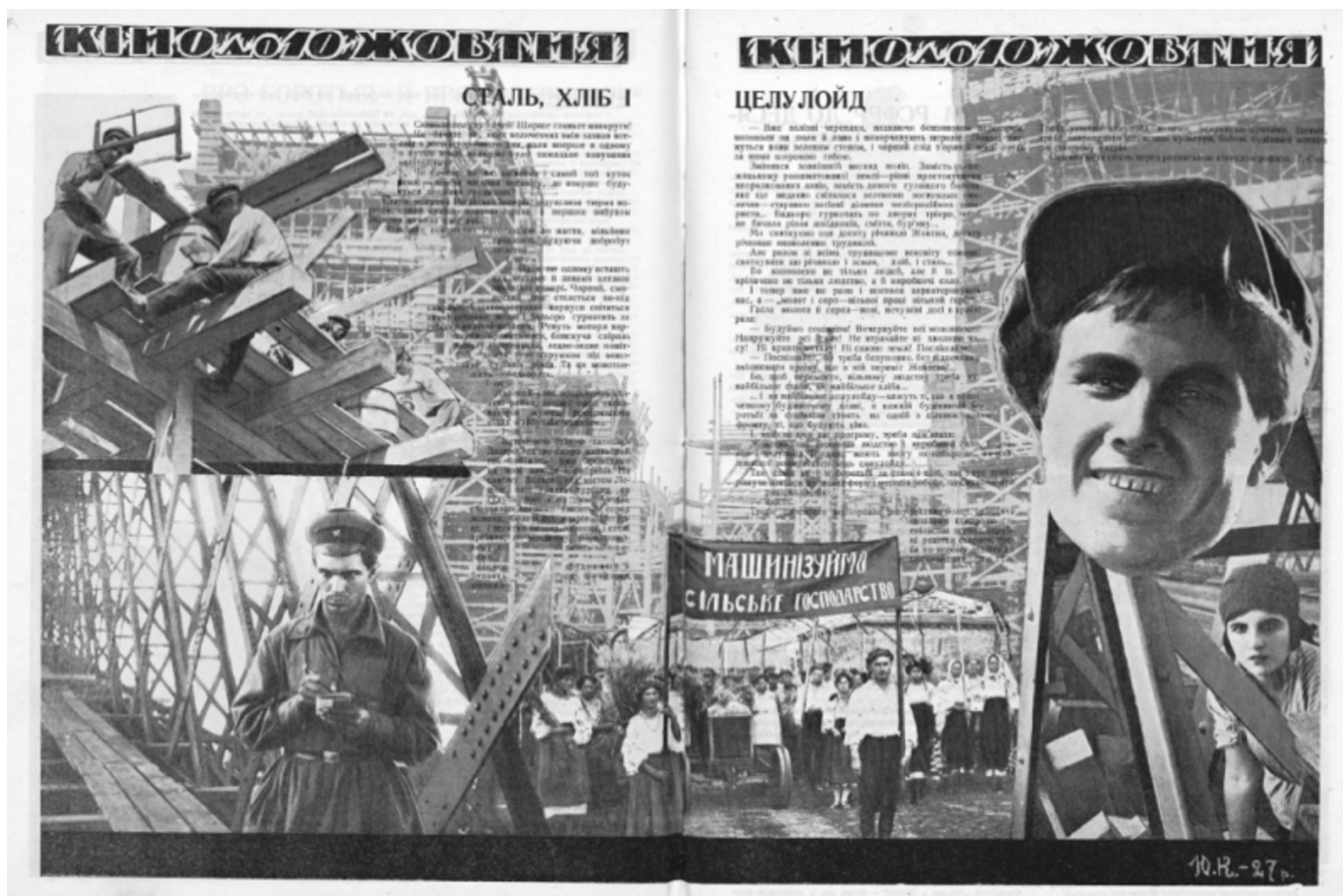
Illustration 23. Photo collage to the text «Steel, Bread and Celluloid».

Christianity, majesty and power in Islam, awakening, enlightenment and wisdom in Buddhism) creates a philosophical undertone. The author's use of all the above-mentioned elements in the photo collage, the general atmosphere of cheerfulness of the collage, created by the dominance of the emotion of joy, in our opinion, creates a philosophical subtext and encourages a thoughtful recipient to make interpretations. In particular, the following interpretation is possible: in order to achieve perfection and life wisdom, a person must walk a path (the zebra of life), full of joyful events and obstacles optimistically perceive the whirlwind of events and diligently create his future. You should pay attention to the silhouette photos of two confused men, whose emotions are antithetical to the dominant atmosphere of optimism in the photo collage. Their placement on the black lines indicates that the aforementioned men, whose small size contrasts with the large images of smiling young