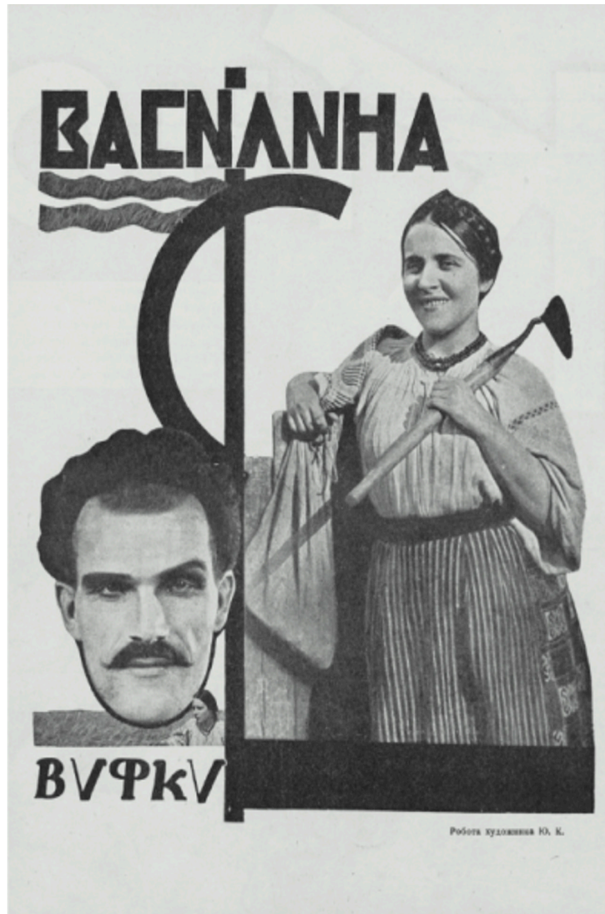
Illustration 20. Photo collage of the movie «ВАСИЛІНА».

emphasized with a black line, indicates an attempt to create a complete image.