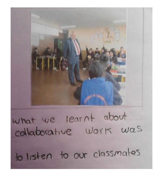
Figure 2. Data Source 3: From students' Artifacts. Book about the experience.

In general, this category addresses the first reflections that were unveiled in the students' journals in which they approached collaborative inquiry by understanding the main aspects of working together. The assets they acknowledge in their