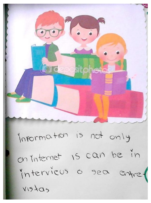
Figure 3. Data Source 16: From students' Artifacts. Book about the experience.

Following the same characterization of language use, Figure 3 shows one part of the book that reported the results of the inquiry process and what the students learned about the places where information is found. They mention interviews, and they clarify the English word with the Spanish words to accomplish the objective of sharing the proper messages they wanted to convey. The artifact more than bilingual is a multilingual text. The image, the Spanish and the English words, build the whole text to express their ideas, in the sense that it "shows the different ways multilingual children combine and juxtapose scripts as well as explore connections and differences between their available writing systems in their text making" (García & Wei, 2014, p. 1303).