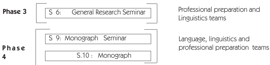
Figure 4. Complement for the General Research component of the Licenciatura Program