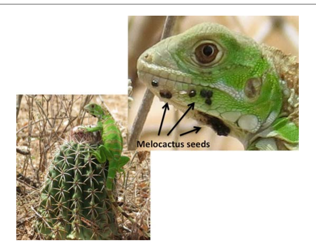
Figure 1. Picture taken on Tatacoa dry forest portraying a juvenile Iguana iguana that had just fed on Melocactus curvispinus fruits. A zoom of the iguana head shows how Melocactus seeds stuck to its snout.