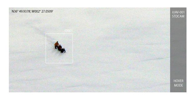
Figure 3: Search of missing persons during the use of UAS [38].

One of the most used applications for the civilian population is one that helps rescuers in situations of natural disaster, provided an opportunity to get to places where people have limitations [36]. Where technological development is a vital tool in detecting, to locate and to rescue victims of natural disasters such as avalanches and earthquakes. In Figure 3. the detection of this type of RADAR and UAV systems are shown [37].