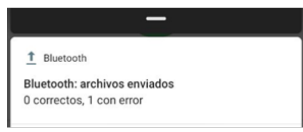
Figure 3: Bluejacking Attack - File Send Error Message.

Attack Deployment: To begin with using the BlueLock application on target device 2 with MAC A0:8D:16:88:A5:BD and block all devices that have Bluetooth enabled. Then it proceeds to create a new contact on attacker device 1 with MAC C0:8C:71:84:94:A1 and sends or shares it with victim device (Figure 3).